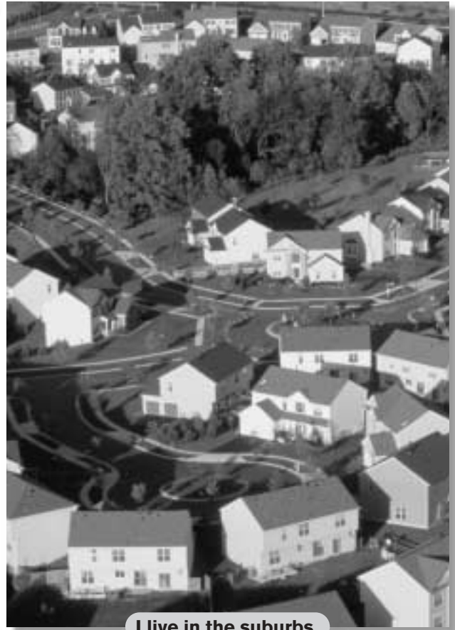
I live in the suburbs.

B Correct the false statements in part A.