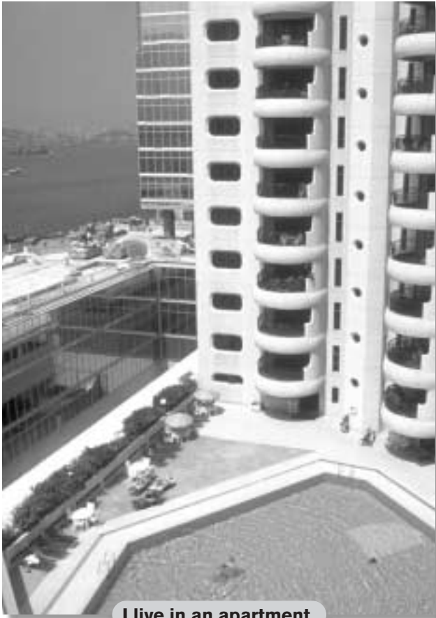
I live in an apartment.